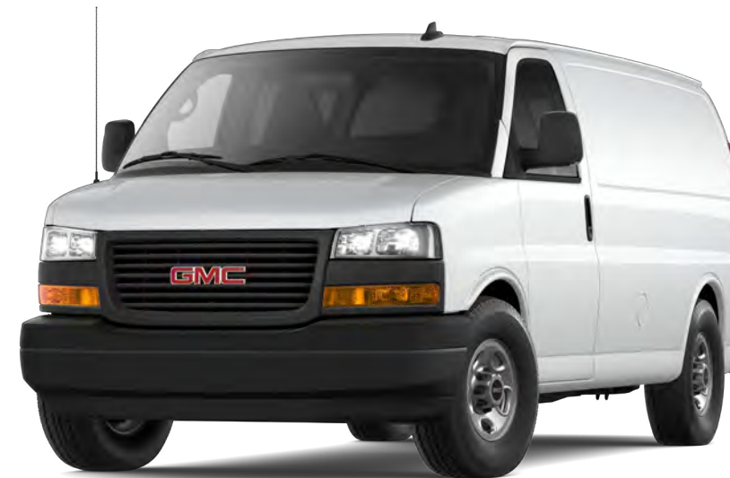
2025 GMC Savana Cargo Van 2500 Regular shown.

NOTE: Exterior colors vary by trim level. See Order Guide for details.