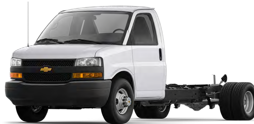
2025 Chevrolet Express Cutaway Work Van shown.

NOTE: Exterior colors vary by trim level. See Order Guide for details.