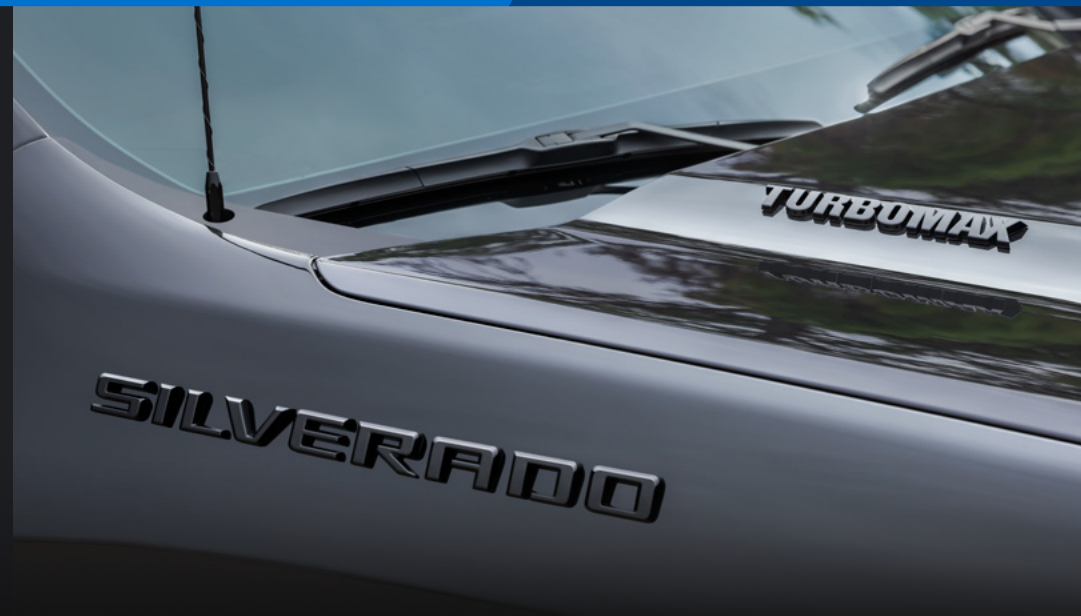
2024 Chevrolet Silverado 1500 shown.