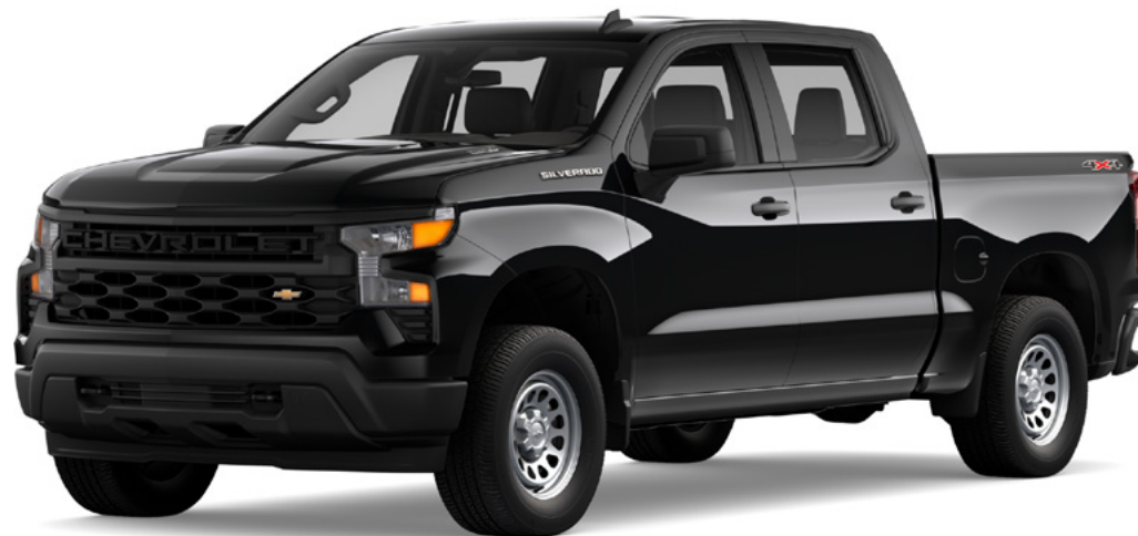
2025 Chevrolet Silverado Crew Cab Work Truck shown.