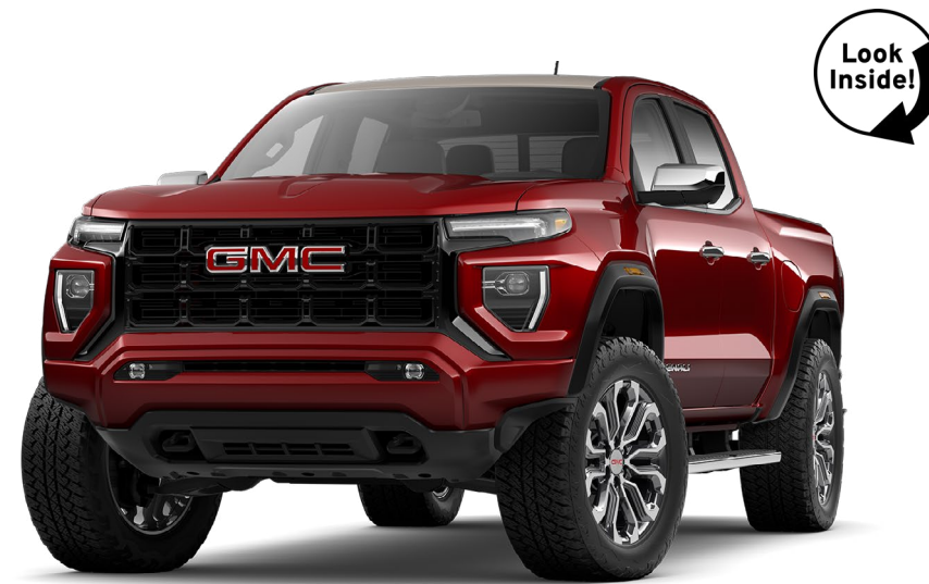
2026 GMC Canyon Denali shown.

NOTE: Exterior colors vary by trim level. See Order Guide for details.