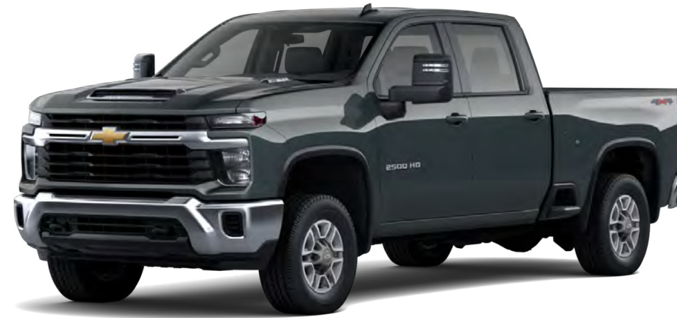
2026 Chevrolet Silverado 2500 HD LT shown.