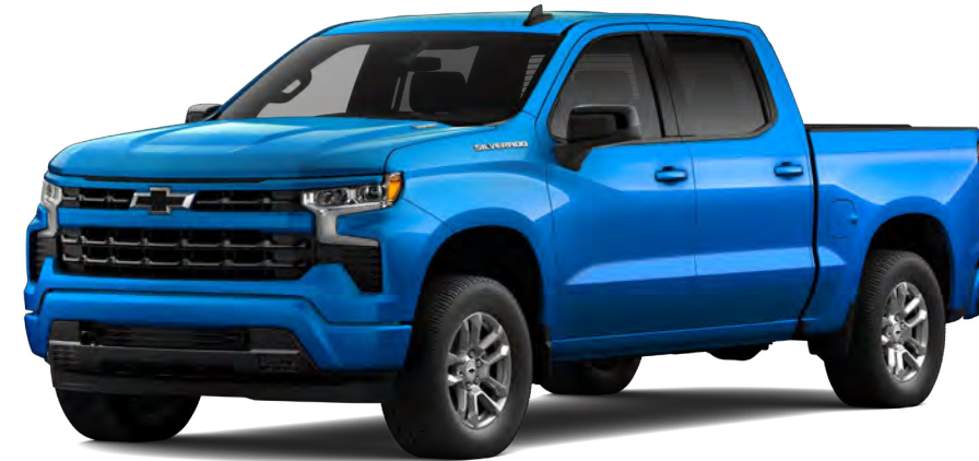
2026 Chevrolet Silverado 1500 RST shown.

NOTE: Exterior colors vary by trim level. See Order Guide for details.