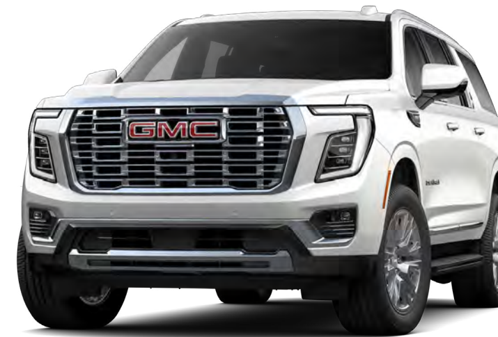
2025 GMC Yukon XL Denali 2WD shown.