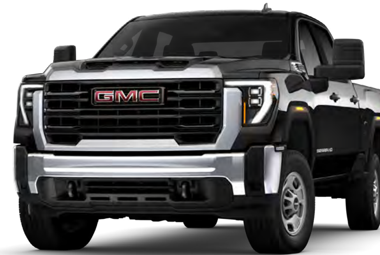
2026 GMC Sierra 2500 Heavy Duty Pro shown.