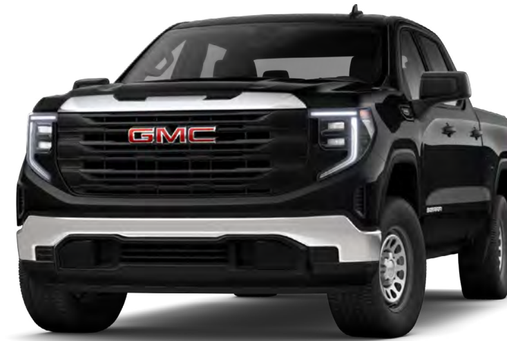
2026 GMC Sierra 1500 Pro shown.

NOTE: Exterior colors vary by trim level. See Order Guide for details.