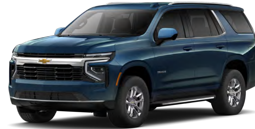
2026 Chevrolet Tahoe LS shown.