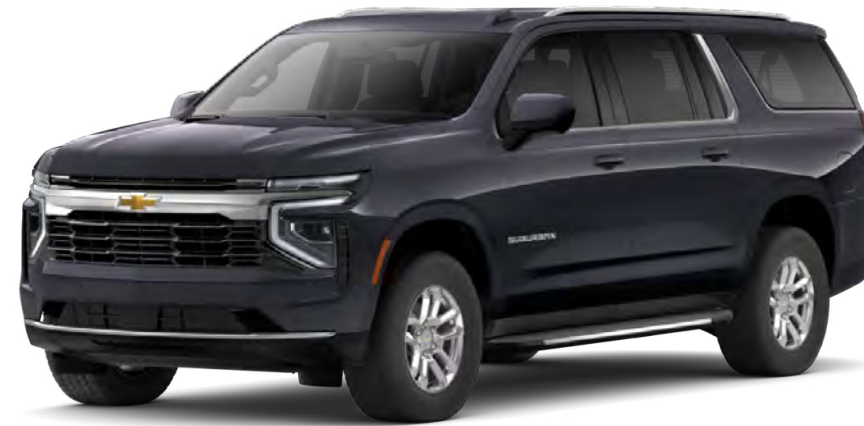
2026 Chevrolet Suburban LS shown.