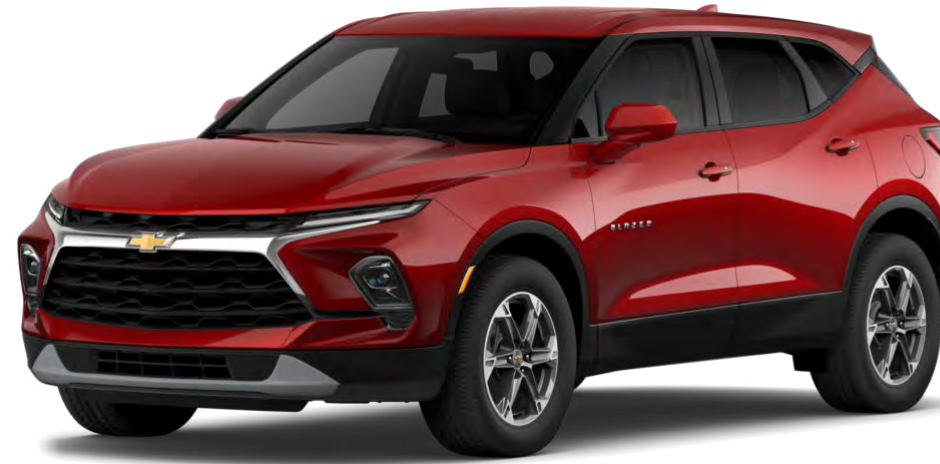
2025 Chevrolet Blazer LT FWD shown.