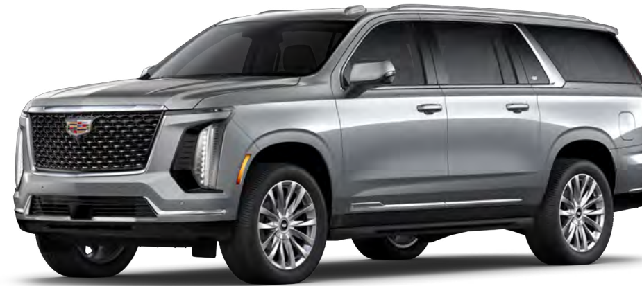
2025 Cadillac Escalade ESV Luxury RWD shown.