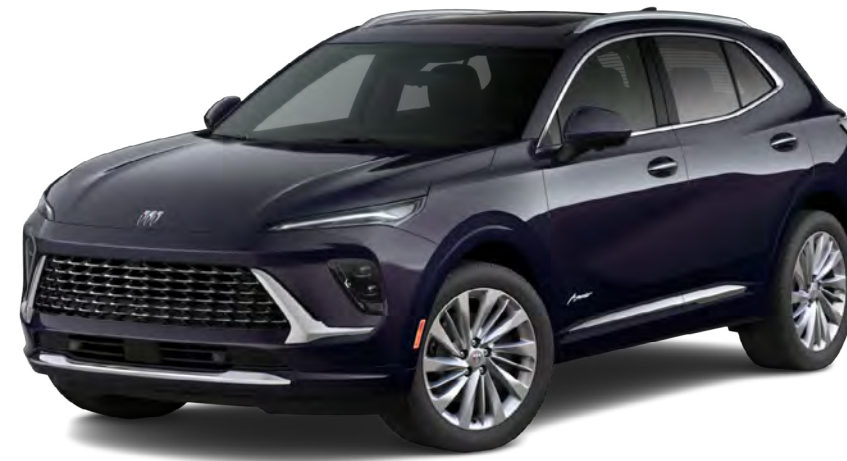
2026 Buick Envision Avenir AWD shown.