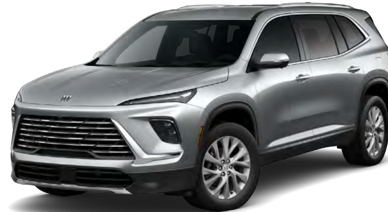
2026 Buick Enclave Preferred shown.