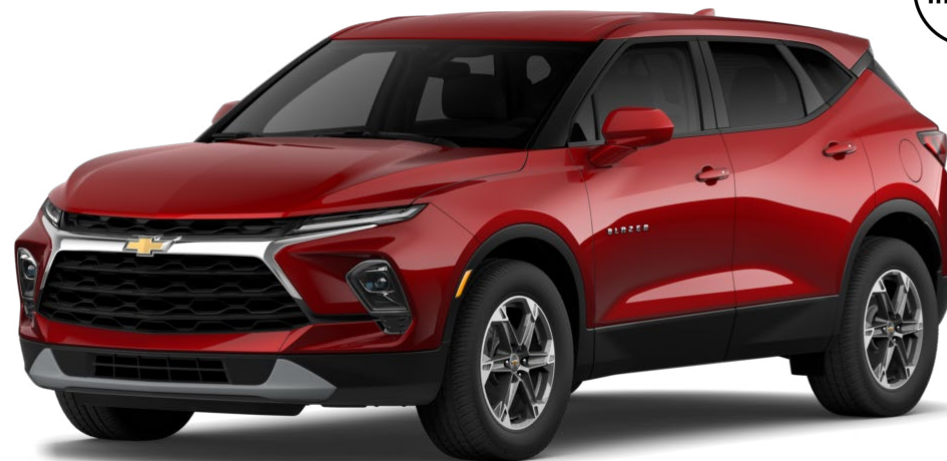
2025 Chevrolet Blazer LT FWD shown.