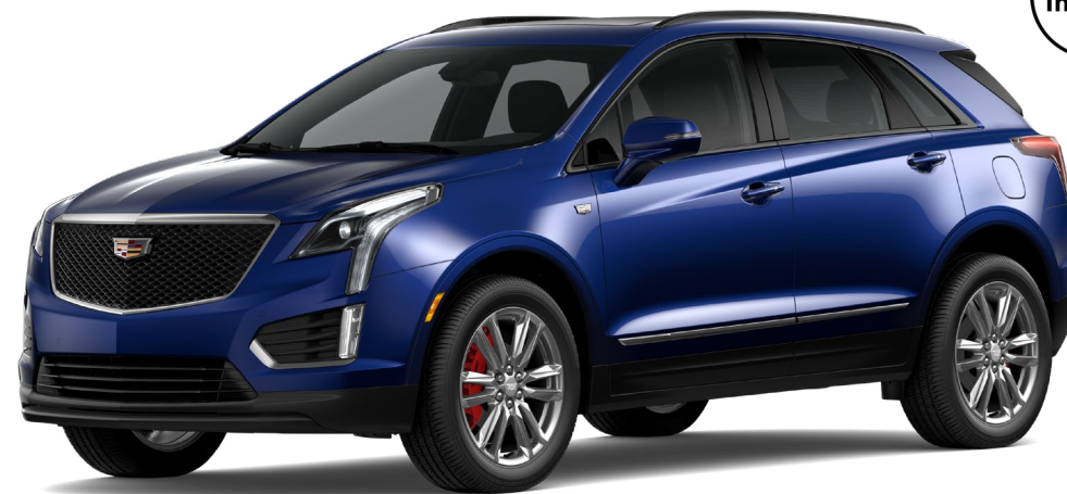
Cadillac 2026 XT5 Sport shown.