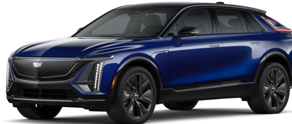
2026 Cadillac LYRIQ Signature Sport RWD shown.