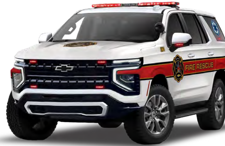
2026 Chevrolet Tahoe SSV shown. Vehicle shown with upfits from an independent supplier and are not covered by the GM New Vehicle Limited Warranty. GM is not responsible for the safety and quality of independent supplier alterations.