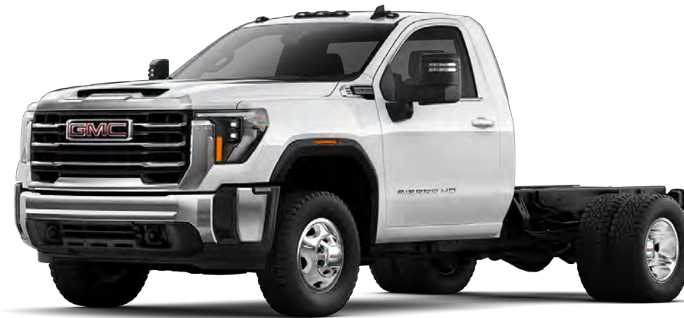
2025 GMC Sierra 3500 Heavy Duty Chassis Cab shown.