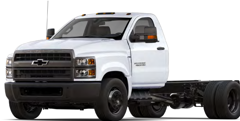
2024 Chevrolet Silverado 4500 HD 1LT shown.