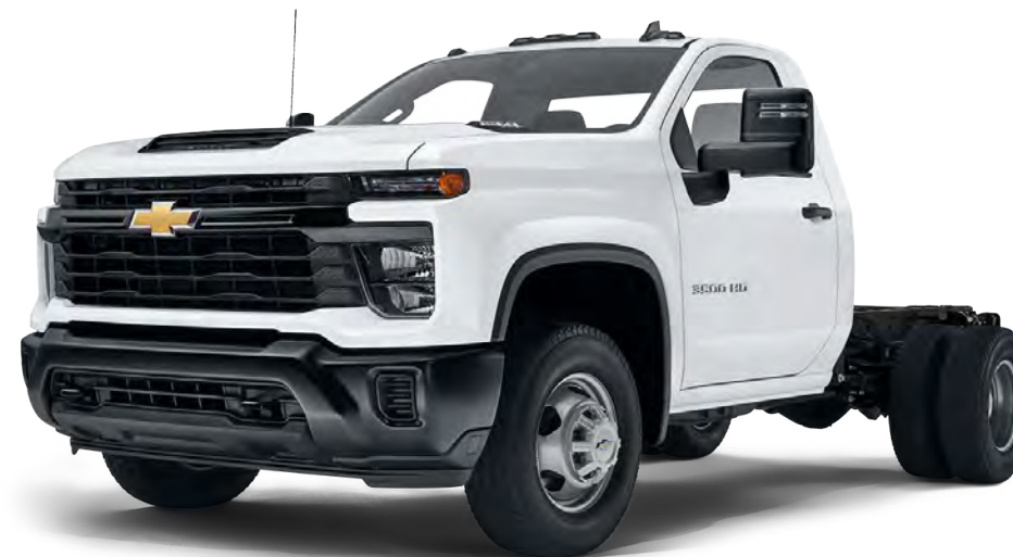
2025 Chevrolet Silverado 3500 HD Chassis Cab shown.