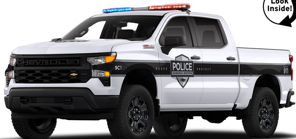
2026 Chevrolet Silverado 1500 PPV shown. Vehicle shown with upfits from an independent supplier and are not covered by the GM New Vehicle Limited Warranty. GM is not responsible for the safety and quality of independent supplier alterations.