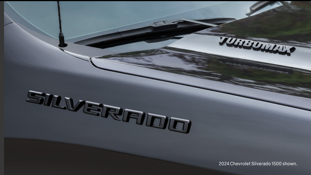
2024 Chevrolet Silverado 1500 shown.