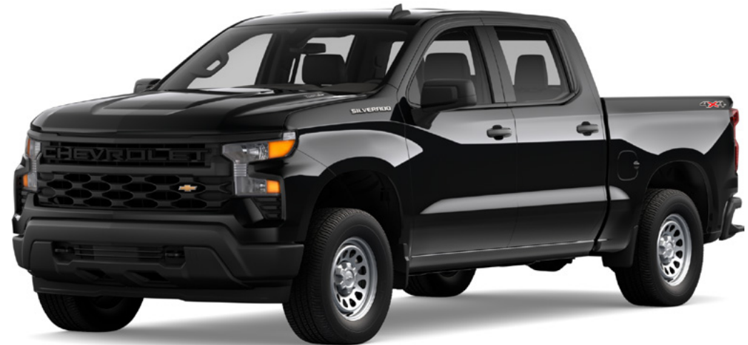
2025 Chevrolet Silverado Crew Cab Work Truck shown.