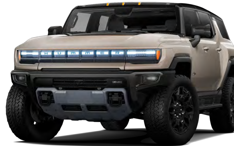
2026 GMC HUMMER EV 2 x shown.