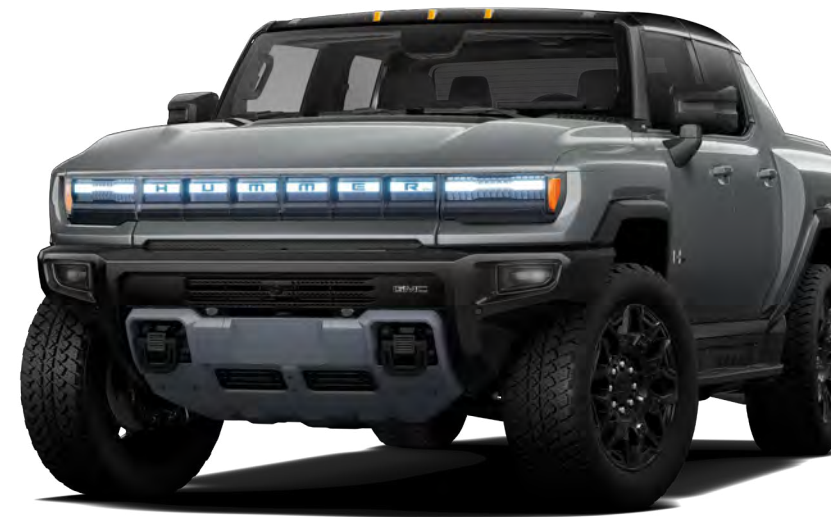
2026 GMC HUMMER EV 2 x shown.