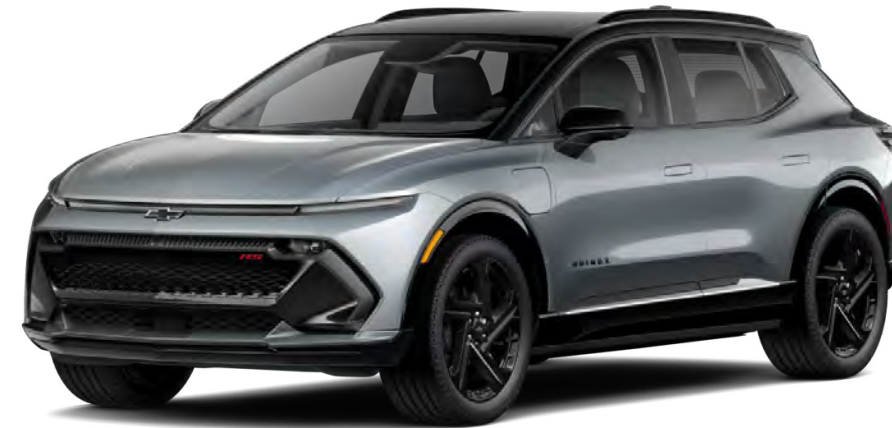
2026 Chevrolet Equinox EV RS shown.