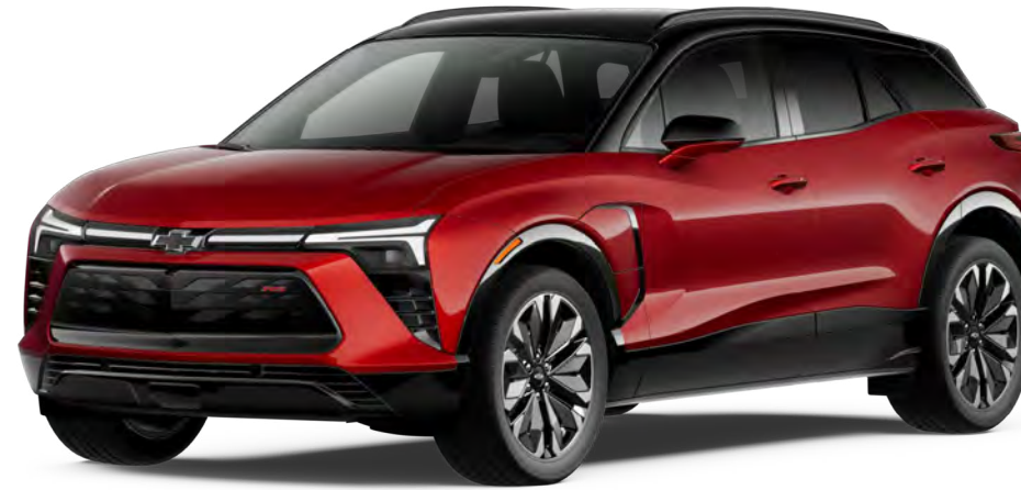
2026 Chevrolet Blazer EV RS shown.