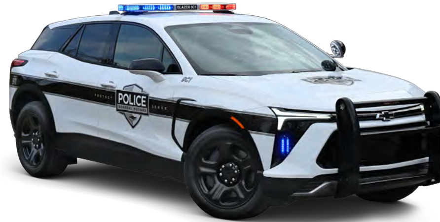
Preproduction 2026 Chevrolet Blazer EV PPV shown. Actual production model will vary. Vehicle shown with upfits from an independent supplier and are not covered by the GM New Vehicle Limited Warranty. GM is not responsible for the safety and quality of independent supplier alterations.