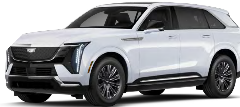
2026 Cadillac ESCALADE IQ Luxury shown.