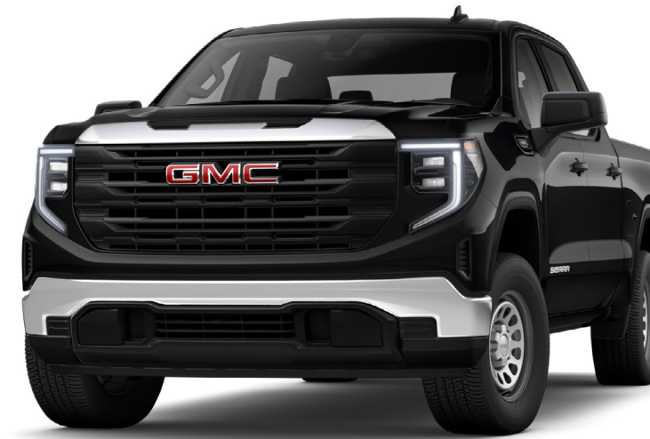
2026 GMC Sierra 1500 Pro shown.

TRUCKS OVERVIEW MODEL AVAILABILITY & SPECIFICATIONS