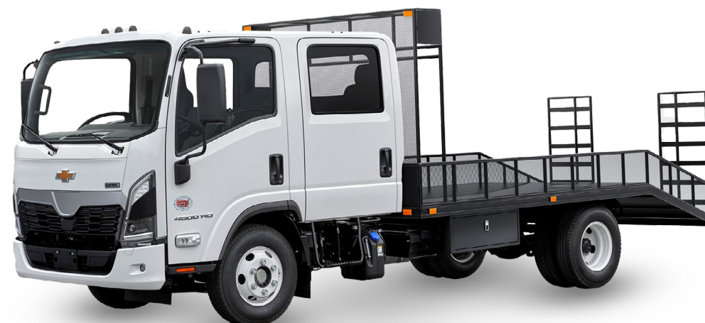
2027 Chevrolet Low Cab Forward 4500 HD shown. Vehicle shown with upfits from an independent supplier and are not covered by the GM New Vehicle Limited Warranty. GM is not responsible for the safety and quality of independent supplier alterations.