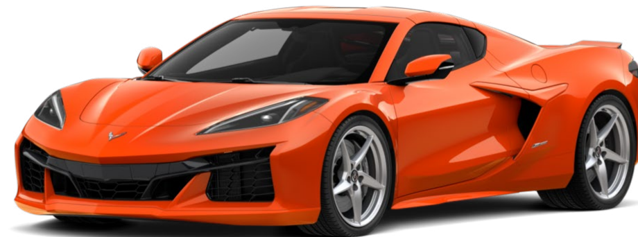
2026 Chevrolet Corvette E-Ray 1LZ shown.