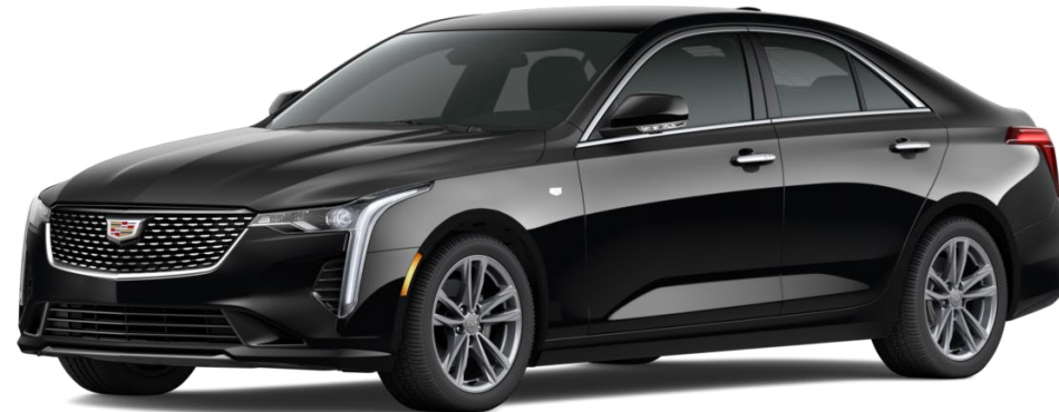
2026 Cadillac CT4 Luxury shown.