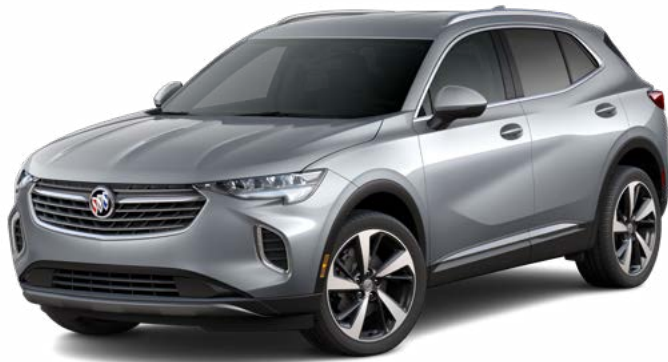
2021 Envision Essence shown.