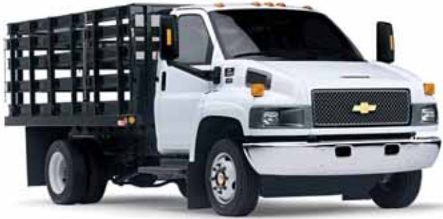
Vehicle shown with equipment from an independent supplier. See the owner's manual for information on alterations and warranties.

Carrying everything from livestock to lumber and scrap metal, platform/stake applications are among the most versatile of work trucks. Properly spec'd, they can meet the diverse needs of many different kinds of customers.