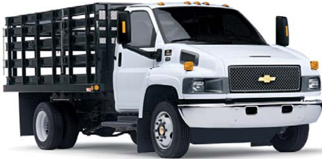
Vehicles shown have been altered or upfitted with equipment supplied by independent suppliers. See the Owner Manual for information on alterations and warranties.

Carrying everything from livestock to lumber and scrap metal, platform/stake applications are among the most versatile of work trucks. Properly spec'd, they can meet the diverse needs of many different kinds of customers.